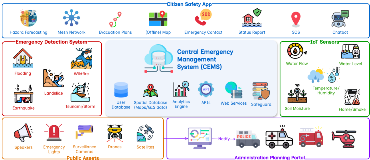
Figure 1. The Unified Geospatial Intelligence Framework (UGIF) Architecture.

simulation (Xiao et al., 2025). Diffusion-based models have been applied to spatiotemporal forecasting (Rühling Cachay et al., 2023), while generative models demonstrate potential in global medium-range weather prediction. In addition, deep generative models have shown substantial improvements in short-term forecasting tasks, such as precipitation nowcasting, offering more accurate and timely predictions (Ravuri et al., 2021, Wang et al., 2023).